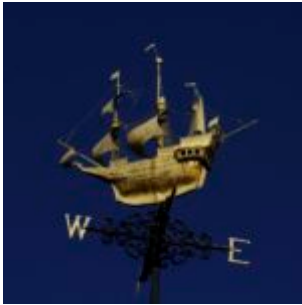
19. Galleon, Castle Street