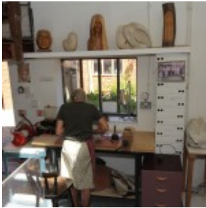
Farnham Pottery workshop