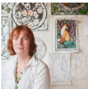
rachel mulligan portrait image copyright New Ashgate Gallery