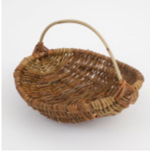
judith needham basket with wood handle