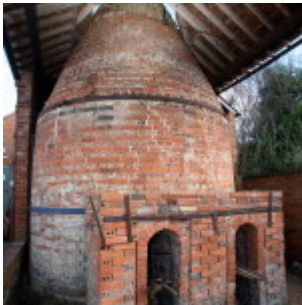
Farnham Pottery kiln