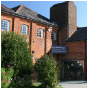
Farnham Maltings front

Saturday 10am–4pm food served 10.30am–2.30pm