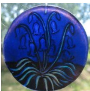
rachel mulligan glass image for workshop