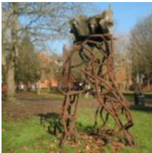
17. Sculpture park