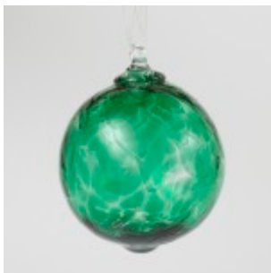
New Ashgate Gallery Shakspeare Glass christmas