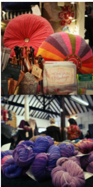
Thread festival, Farnham Maltings