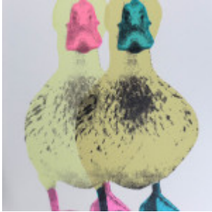
Charlotte Gerrard, Birds of a Feather.