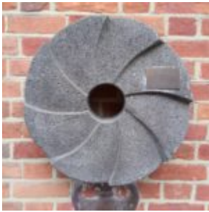
1. Andernach mill stone

Download your copy of the Farnham Public Art Trail here .