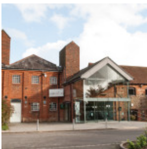
Outside of the Farnham Maltings.