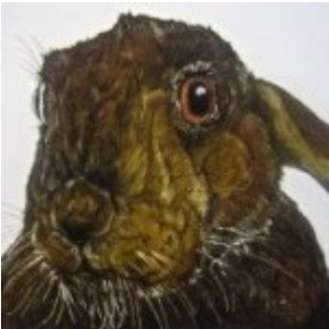
hare_s_looking_at_you New Ashgate Gallery