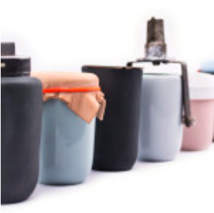
Aimee Bollu – Curious Boxes – Photographer Yasmin Ensor. New Ashgate