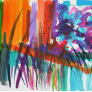
Tessa Pearson – Garden Dreams orange study copyright New Ashgate Gallery