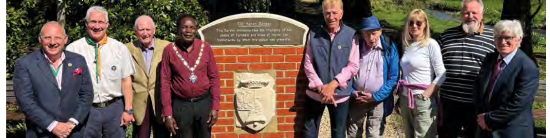
Celebrating 75 years of friendship with Haren.