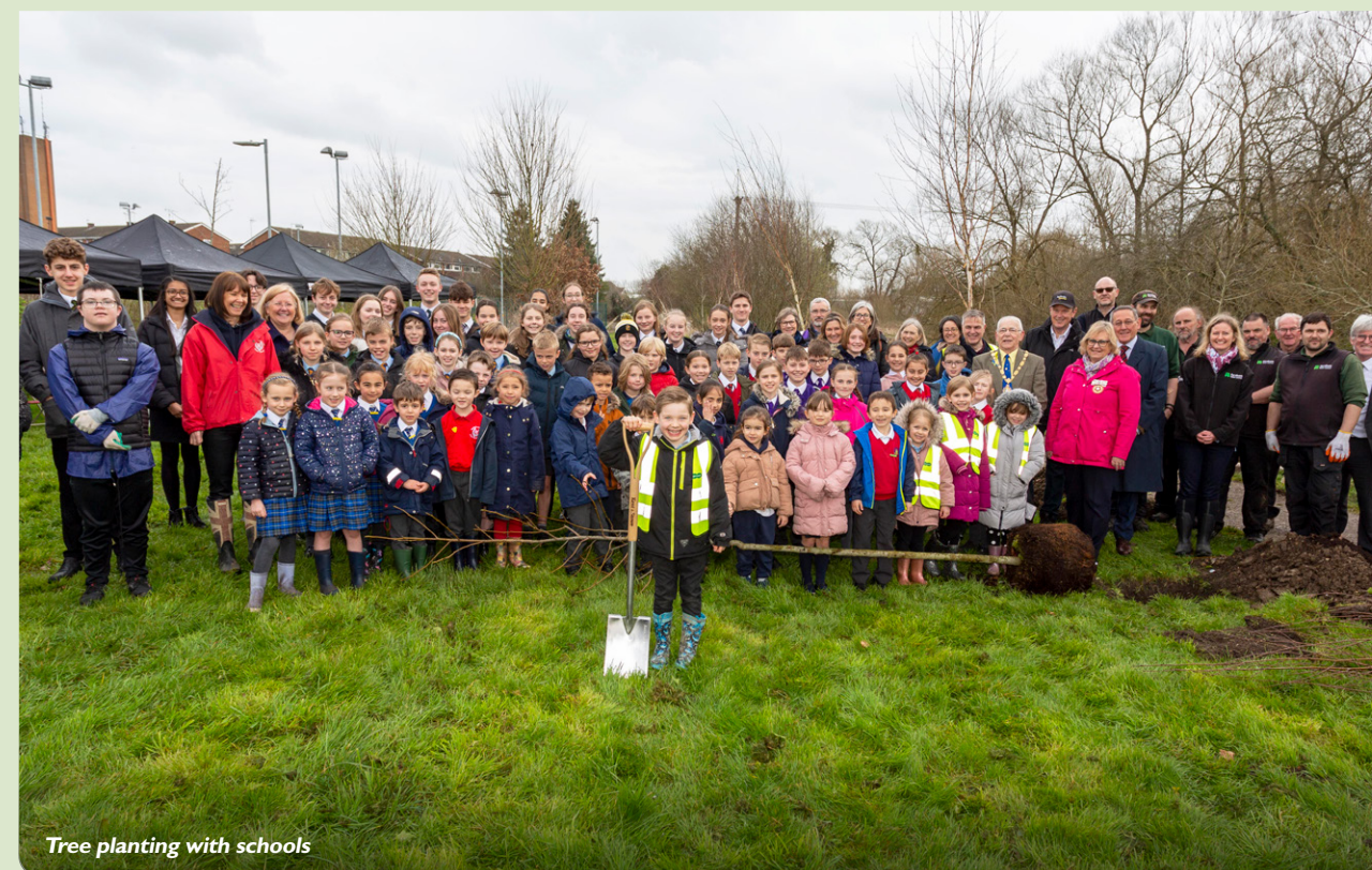
Tree planting with schools

Mulching with soil improver from a local contractor and home-grown compost from garden waste is used on the beds to lock in moisture and reduce the need for watering.