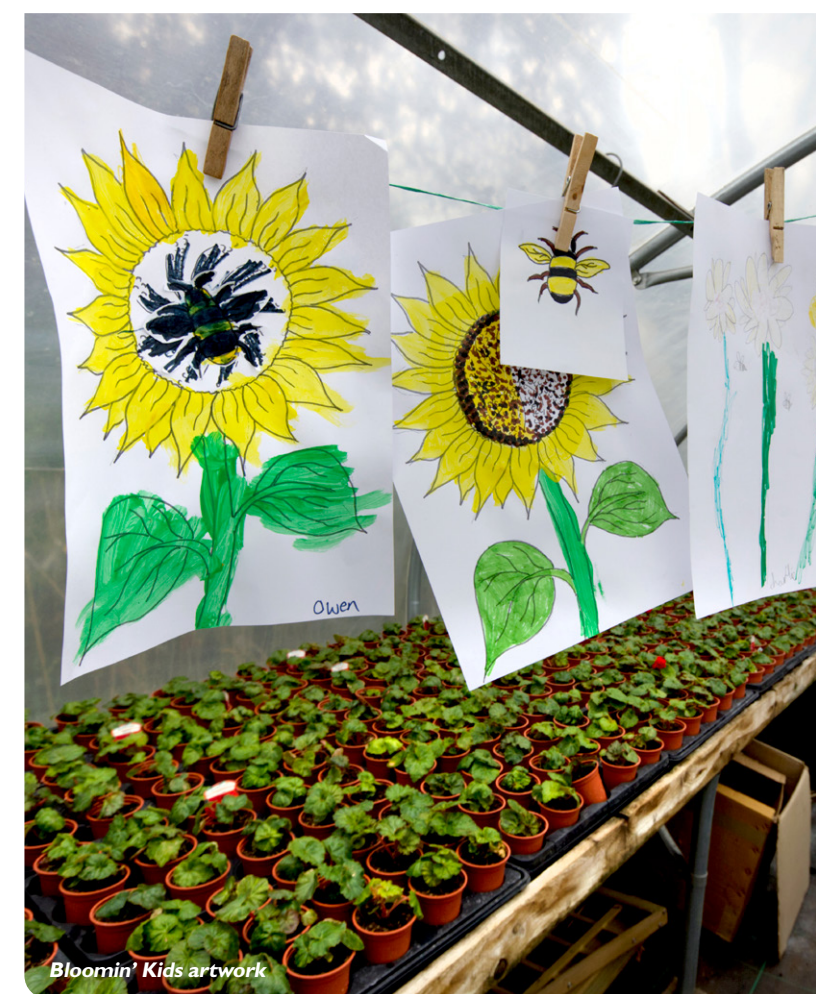
Bloomin' Kids artwork