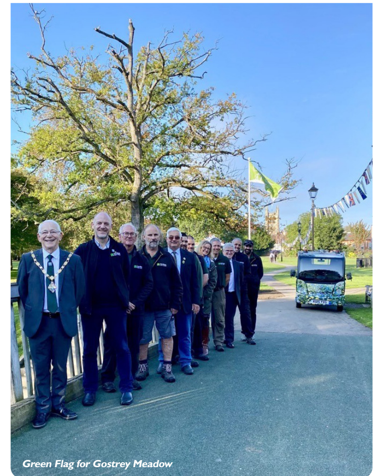
Green Flag for Gostrey Meadow

The students have all grown in confidence, learnt new skills and improved an important school space for other students and staff to appreciate.