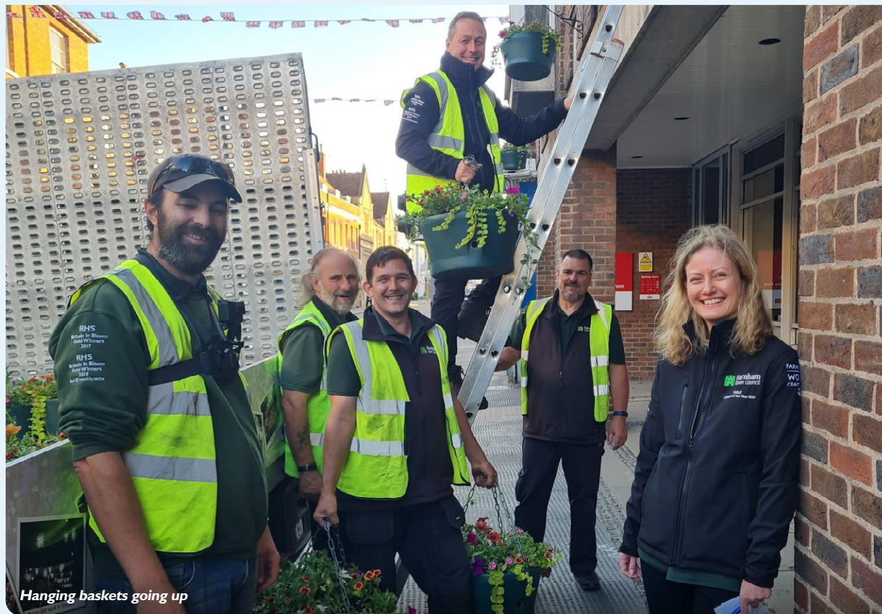
Hanging baskets going up

An old tree stump in Gostrey Meadow provided the perfect reason to create a new carpet bed. Local school children entered a 'Design a carpet bed' competition for the second year with the theme of Pollination. The winning design featured a colourful butterfly design. The design was recreated perfectly by a plant supplier for all to enjoy.