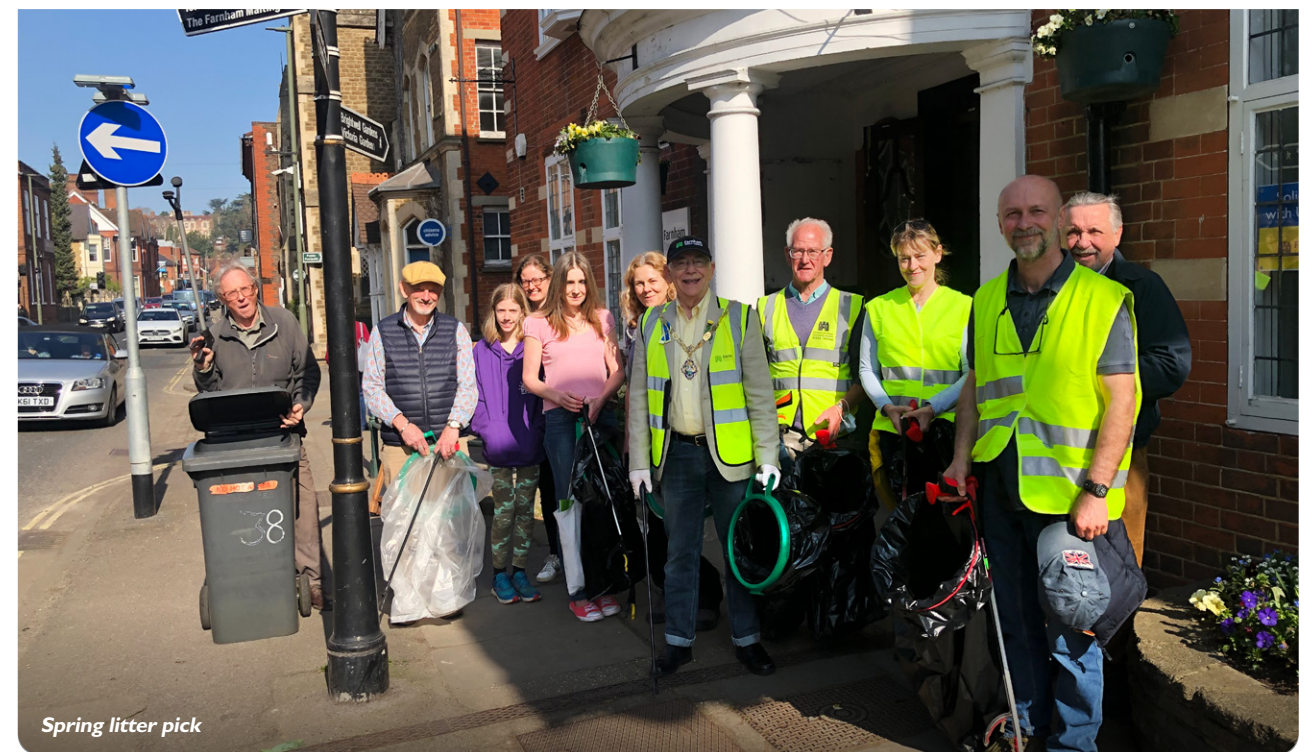
Spring litter pick