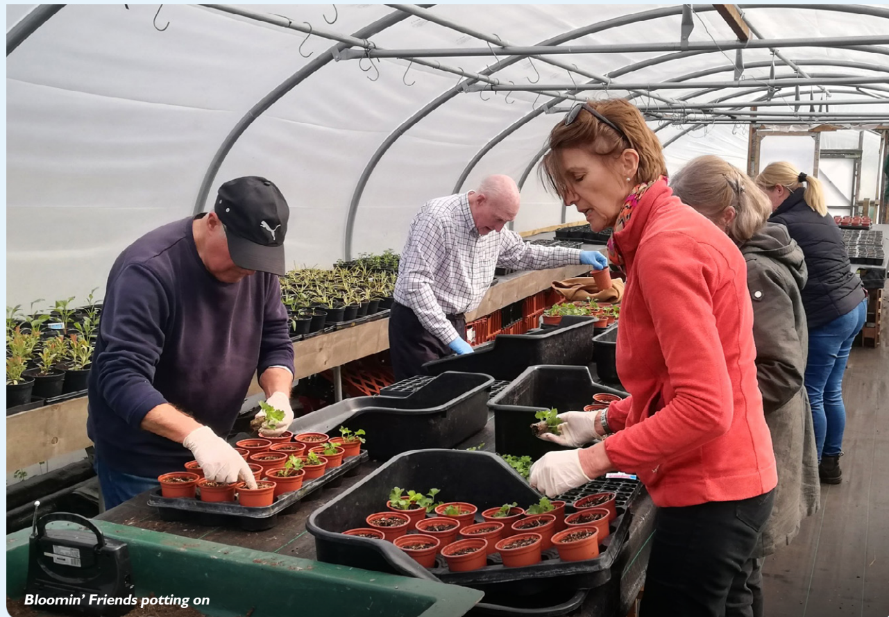
Bloomin' Friends potting on

Community is always at the forefront of Farnham in Bloom and 2022 is no exception.