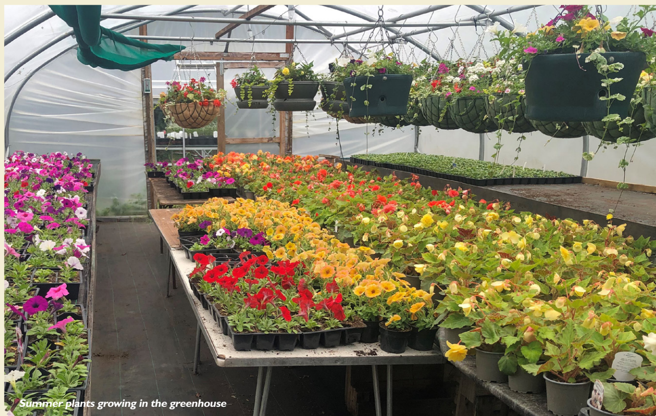
Summer plants growing in the greenhouse

We have extended and added to our wildflowers areas in twelve locations with an overall increase of 45% this year and now have wildflower areas totalling one and half acres. These spaces attract a range of pollinating insects and will improve and produce beautiful flowers year-on-year for all to enjoy.