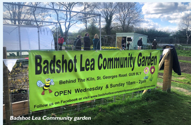
Badshot Lea Community garden