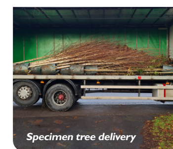
Specimen tree delivery