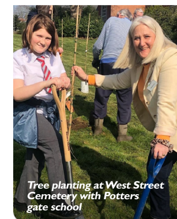
Tree planting at West Street Cemetery with Potters gate school