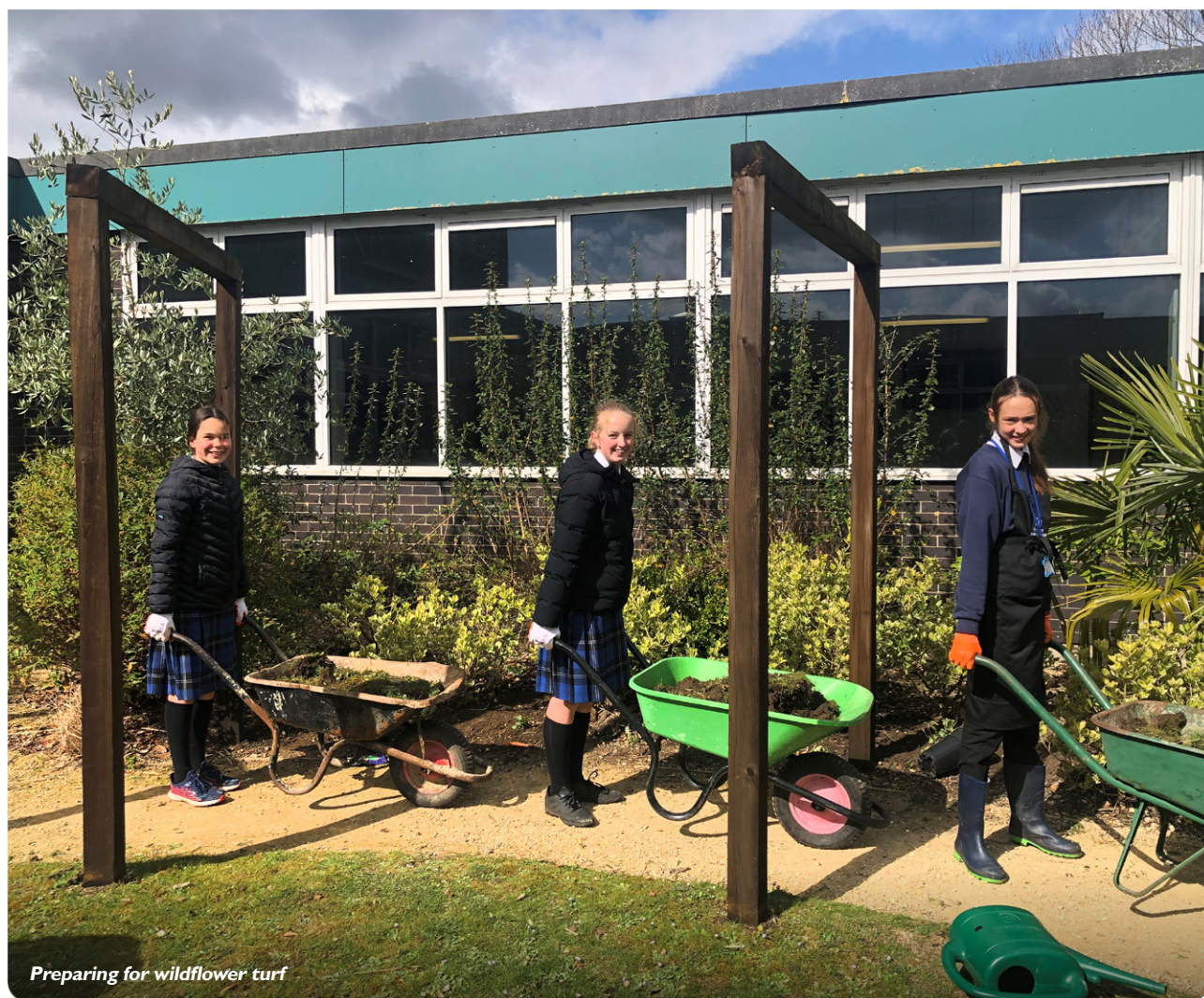
Preparing for wildflower turf

Farnham in Bloom is passionate about helping the local environment, strengthening biodiversity and supporting Farnham Town Council's aim of becoming a carbon neutral council by 2030.