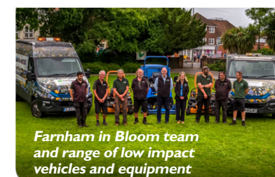
Farnham in Bloom team and range of low impact vehicles and equipment

Men in Sheds, a group for those interested in making and repairing, undertake projects for other community groups and organisations. This year, Farnham in Bloom, have asked them to build giant bug hotels to increase biodiversity in the Cemeteries.