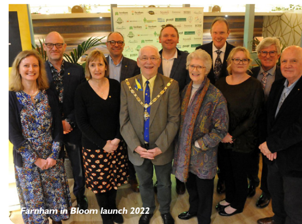
Farnham in Bloom launch 2022

Sponsorship is vital to the success of Farnham in Bloom and we are delighted that for the second year The Patio Black Spot Removal Company Ltd is our Principal sponsor.