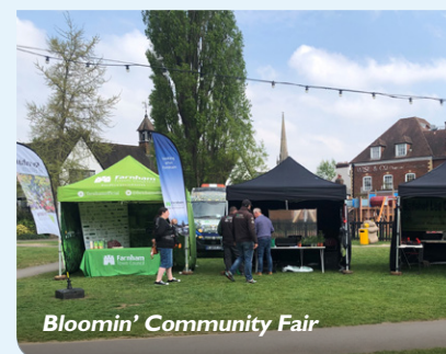
Bloomin' Community Fair

Schools have again been enthusiastic to get involved in Farnham in bloom activities and events this year after restrictions have been lifted. We welcomed 11 schools to the nursery to make up hanging baskets and learn about plants, flowers and how to take care of them. Schools