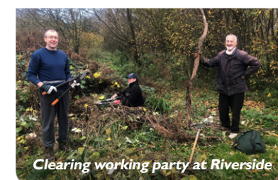
Clearing working party at Riverside