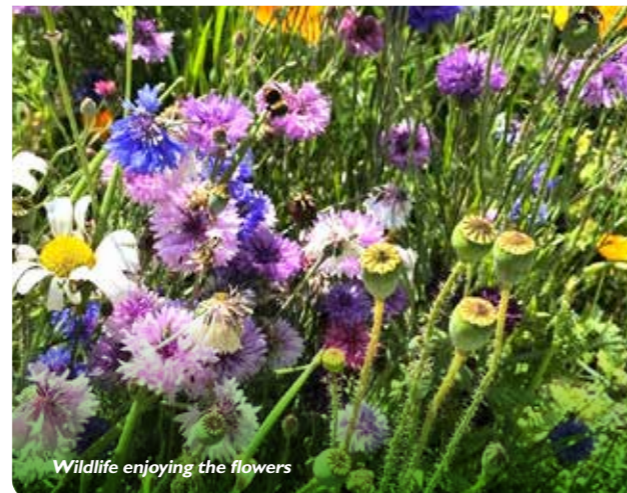
Wildlife enjoying the flowers

Continuing use of low noise electric tools has further reduced the impact on the environment.