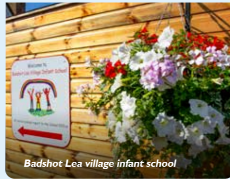
Badshot Lea village infant school

Farnham in Bloom is about making Farnham an attractive place to live and work in or to visit: filling it with flowers and keeping the town and surrounding villages looking their best and encouraging people to work together. Farnham in Bloom is part of the wider Community Enhancement work for the Town with a particular focus in the summer months on: