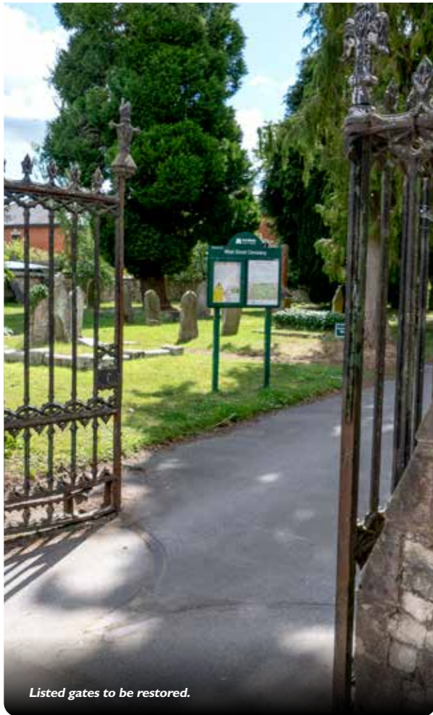
Listed gates to be restored.

New railings are to be made by a local blacksmith who works out of the Rural Life Centre in Tilford. The restrictions meant that the blacksmith could not continue with this work. The restoration of the listed gates was also put on hold. It is hoped that these two projects will be restarted later in 2020.