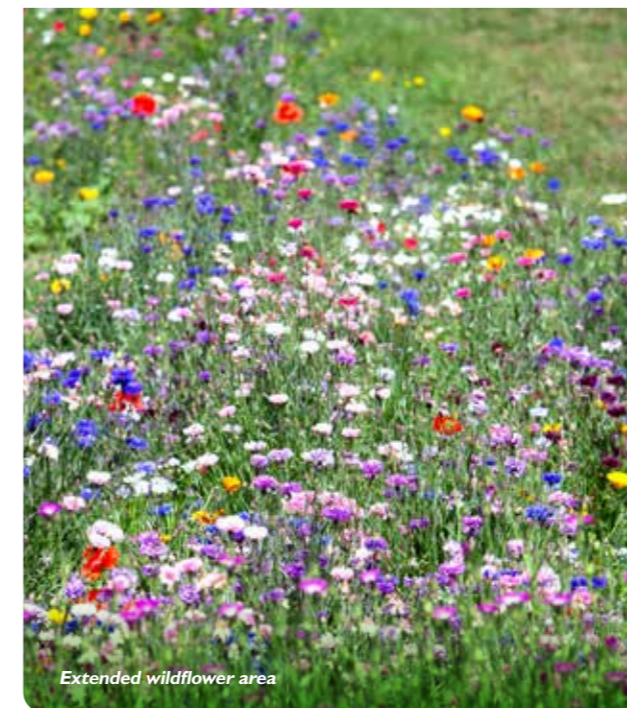
Extended wildflower area

The large wildflower area in the central part of the cemetery has been extended to provide an excellent corridor for wildlife from the surrounding green spaces including Bishop's Meadow. Many species such as bees and butterflies have thrived in this space. The grass around the graves has been well maintained to ensure that it is a safe place for visitors.