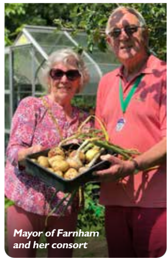
Mayor of Farnham and her consort

In February when we welcomed our Farnham in Bloom community to our Bloomin' Big Meet, little did we know what 2020, our 30 th year, had in store for us!