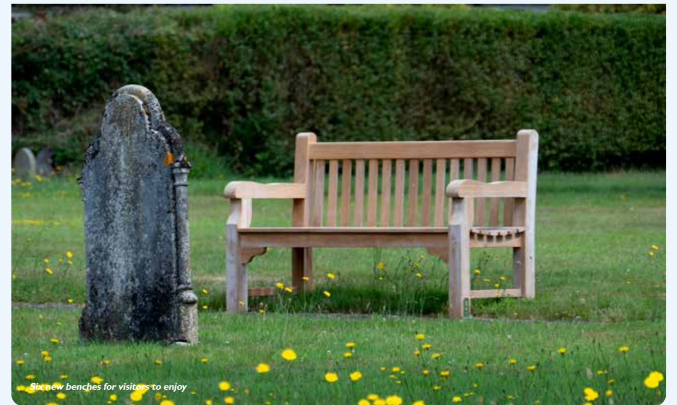
Six new benches for visitors to enjoy

Six new benches have been placed in the cemetery for visitors to enjoy. The upkeep and maintenance has continued so that when restrictions were lifted, it could once again be enjoyed by the local community.