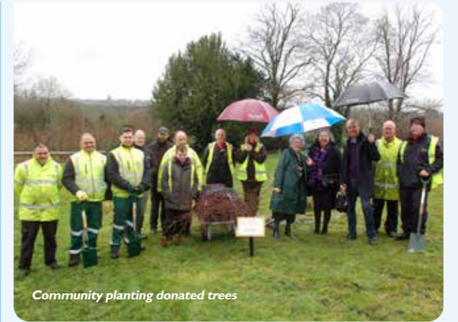
Community planting donated trees

They were keen to get involved and support the local community and this working party was an ideal launch event of the Friends of West Street Cemetery. Other