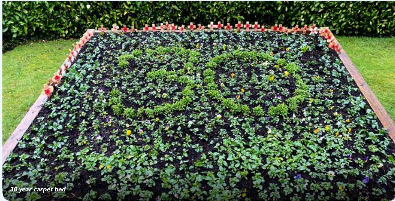
30 year carpet bed