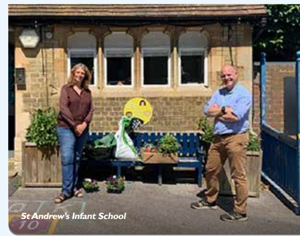
St Andrew's Infant School

Eleven local schools took part in the hanging baskets competition. Instructions and materials were delivered to schools so they could make up and grow on their plants. The competition involved staff and keyworker children.