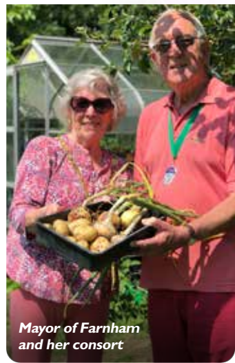
Mayor of Farnham and her consort

In February when we welcomed our Farnham in Bloom community to our Bloomin' Big Meet, little did we know what 2020, our 30 th year, had in store for us!