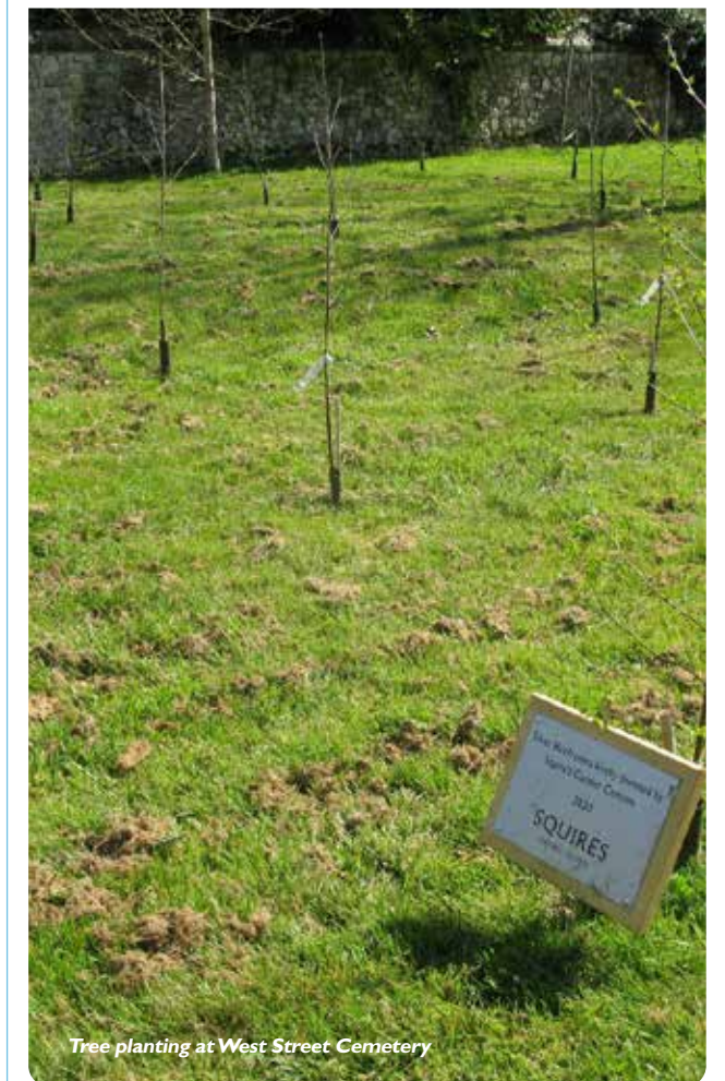
Tree planting at West Street Cemetery

Fourteen-thousand spring bulbs were planted around the town for residents and visitors to enjoy.