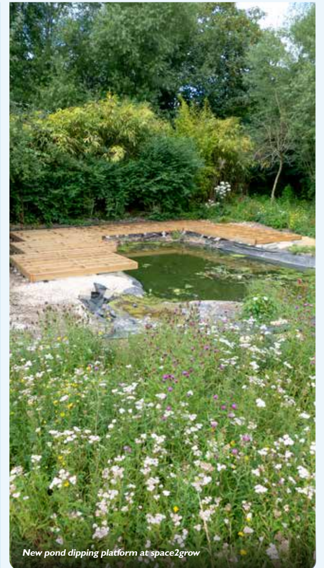
New pond dipping platform at space2grow

The community group space2grow had to halt activities and events during lockdown but with a few core volunteers and social distancing measures in place, their garden has thrived and is a haven for wildlife including 22 species of moths found in a recent survey. Larger projects such as decking around a pond and the building of a pizza oven were put on hold.