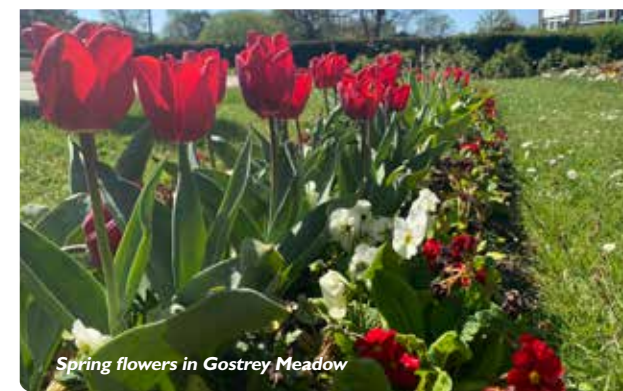
Spring flowers in Gostrey Meadow

The areas had previously been looked after by the borough council's contractors. We took the opportunity to take a fresh look at the gardens and to put in place improved standards of environmental and horticultural practice.