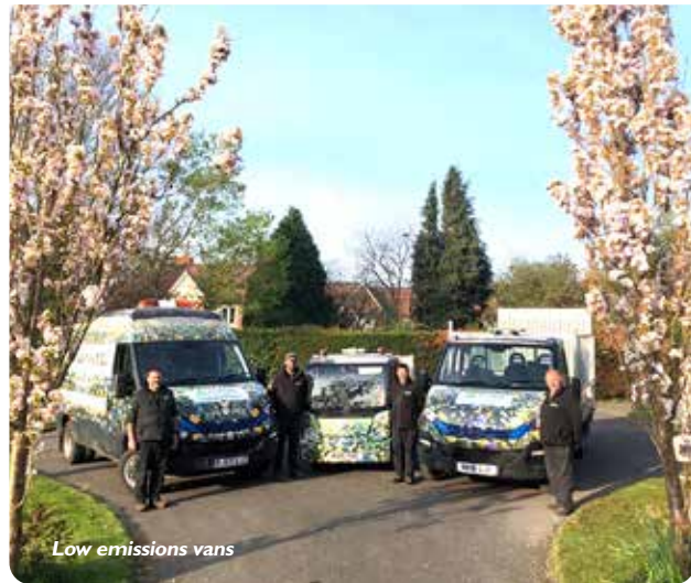
Low emissions vans

We have continued to maintain our normal horticulture practices which include using peat free compost and slow-release fertiliser in all the plant containers and baskets.