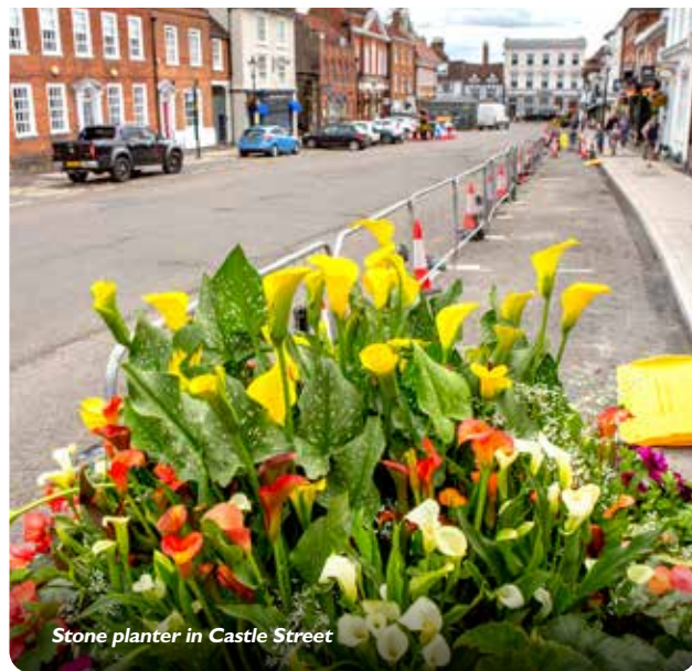
Stone planter in Castle Street

A large new Iveco van has been purchased to complement our existing fleet of vehicles. It is fuelled by CNG (Compressed Natural Gas) instead of diesel and is more environmentally friendly, quieter and more efficient.