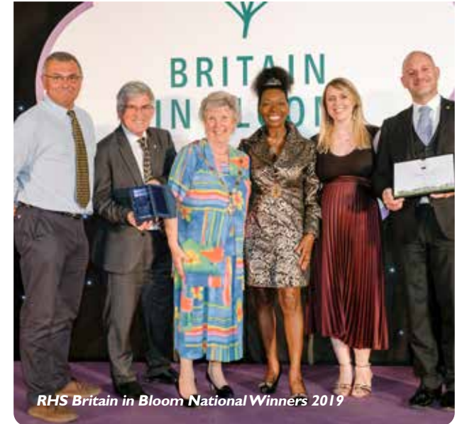
RHS Britain in Bloom National Winners 2019