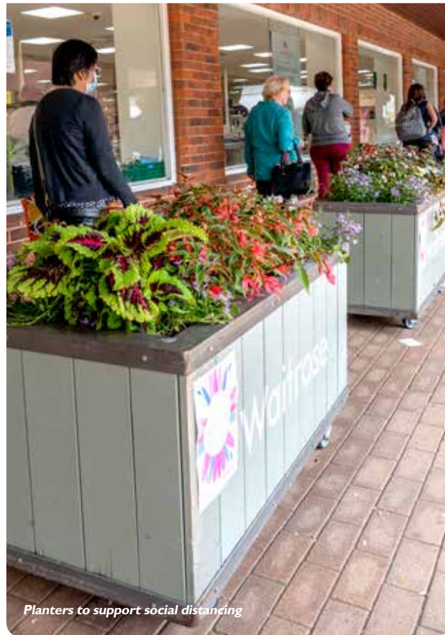
Planters to support social distancing

To support businesses and to enable shoppers to maintain social distance as lockdown restrictions eased, Farnham was part of a pavement widening scheme. To soften the look of the scheme, Farnham Town Council alongside Surrey County Council provided 40 extra planters in the town. These were planted up with summer flowers.