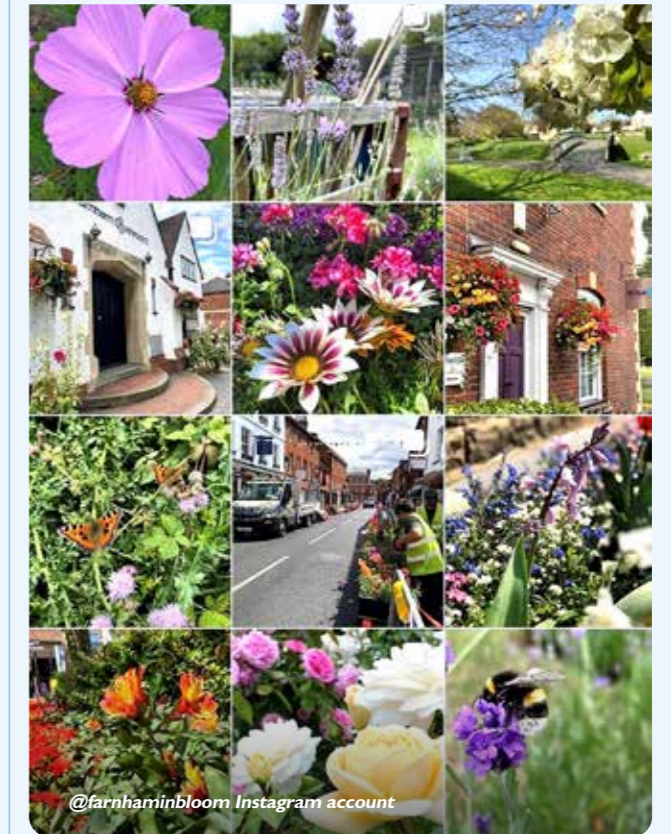
@farnhaminbloom Instagram account

Sponsor benefits were modified so that businesses could promote their business through opportunities such as judging competitions and by being tagged in social media posts.