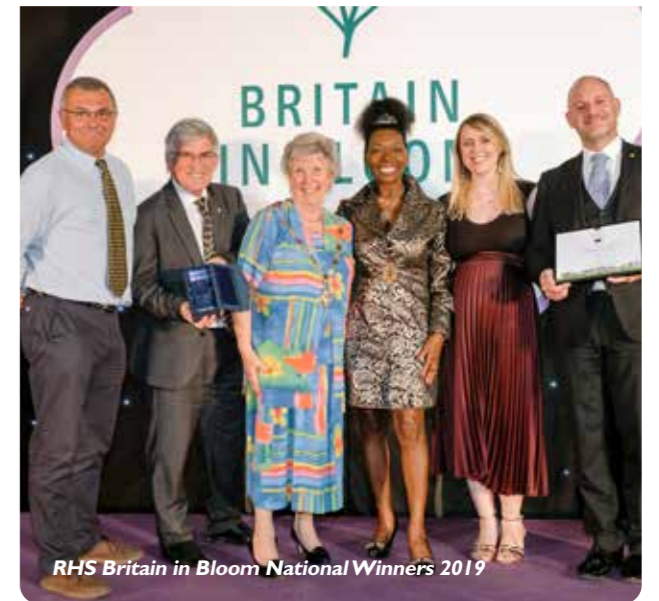
RHS Britain in Bloom National Winners 2019