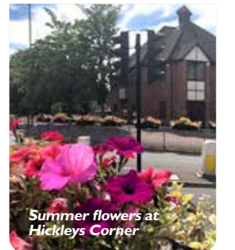
Summer flowers at Hickleys Corner