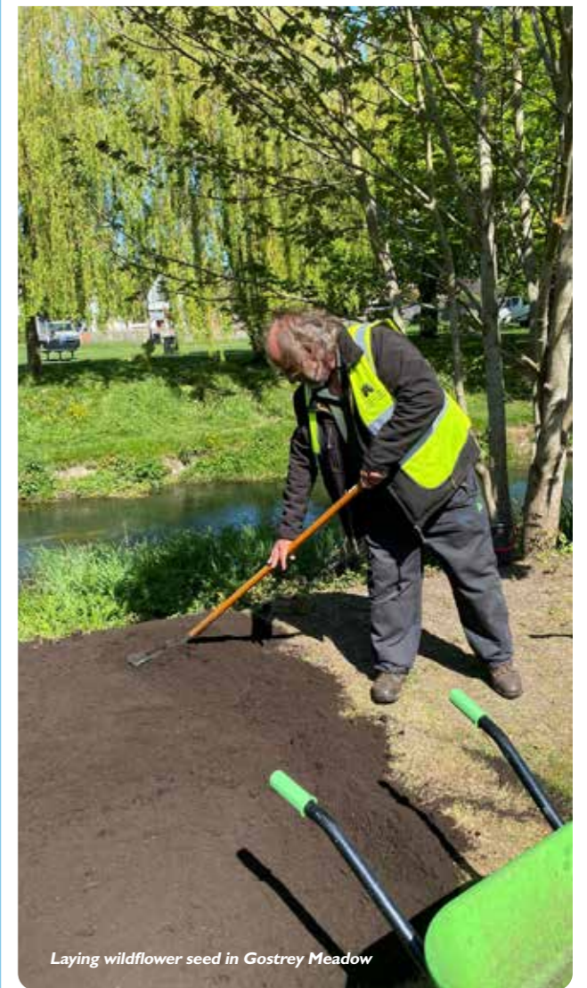
Laying wildflower seed in Gostrey Meadow

At Batting's Garden, our outside workforce team cleared old shrubs and we set up a working party to support the planting phase. This project had to be put on hold due to the coronavirus outbreak.