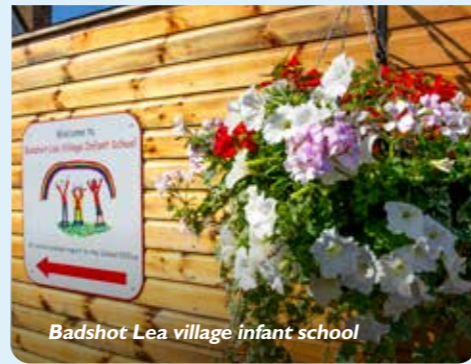
Badshot Lea village infant school

Farnham in Bloom is about making Farnham an attractive place to live and work in or to visit: filling it with flowers and keeping the town and surrounding villages looking their best and encouraging people to work together. Farnham in Bloom is part of the wider Community Enhancement work for the Town with a particular focus in the summer months on: