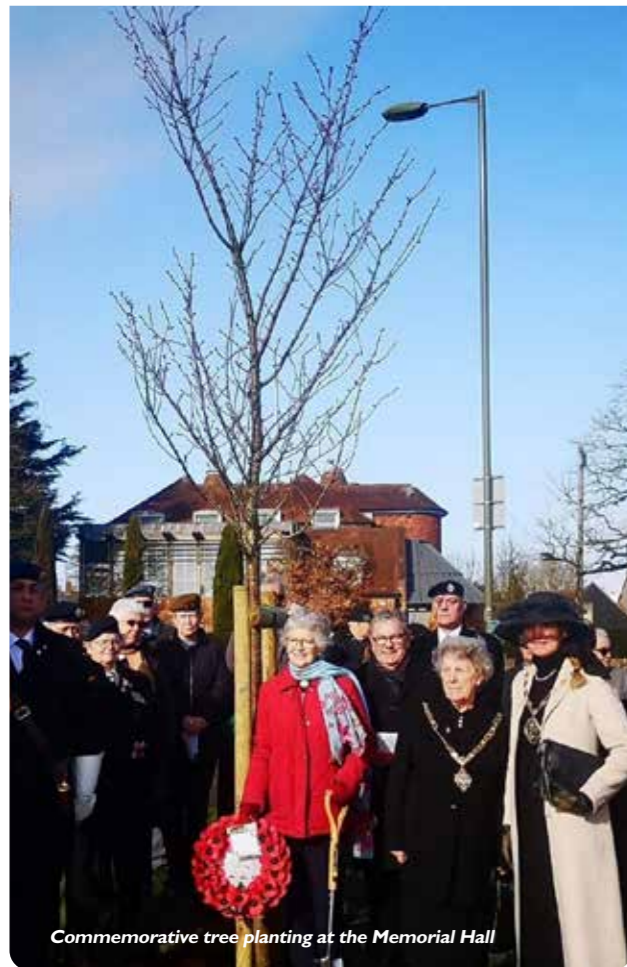
Commemorative tree planting at the Memorial Hall

All the normal horticulture practices have been maintained including using peat free compost and slow-release fertilizer and in all the plant containers and baskets.