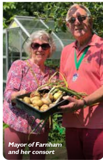
Mayor of Farnham and her consort

In February when we welcomed our Farnham in Bloom community to our Bloomin' Big Meet, little did we know what 2020, our 30 th year, had in store for us!