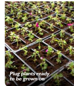
Plug plants ready to be grown on