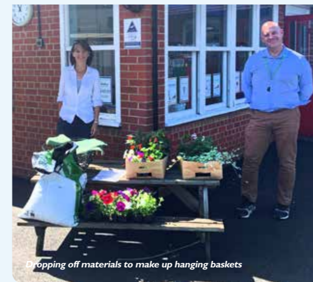
Dropping off materials to make up hanging baskets

Eleven local schools took part in the hanging baskets competition. Instructions and materials were delivered to schools so they could make up and grow on their plants. The competition involved staff and keyworker children.