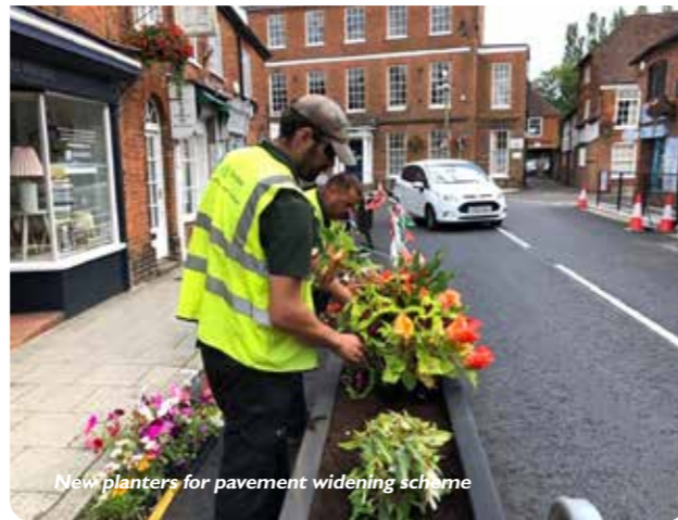
New planters for pavement widening scheme

During the lockdown period, the allotments provided a welcome distraction for many plot holders. The sense of community was strengthened with activities such as a scarecrow competition and a socially distanced plant and seed swap.