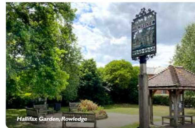
Halifax Garden, Rowledge

Despite the lockdown, all members of the outside work force, were retained and focused their time on maintaining the green spaces in the town centre and the surrounding villages. Twenty-six thousand plug plants for the hanging baskets, troughs and planters were nurtured in the greenhouse. Varieties such as Coleus chocolate cherry, Impatiens violet, Petchoa Sunray Pink, Calla Lilies and Salvia Mystic Spires have helped lift people's spirits during a difficult time.