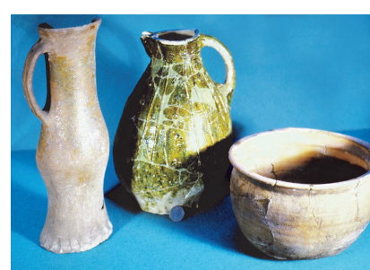
13th century 'Surrey whiteware' from castle