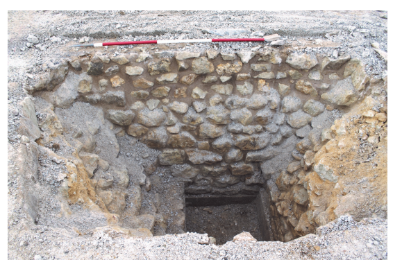
Reconstruction of original castle keep and excavation of well-shaft cut into the tower's foundations (Photo and section by M W Thompson, redrawn by Audrey Graham)