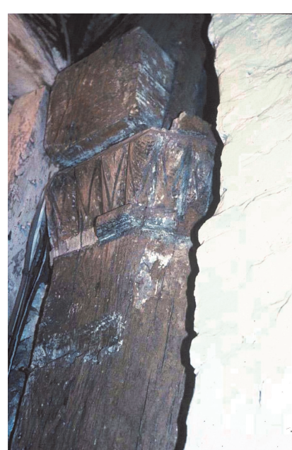
Norman pillar carved from timber from castle chapel