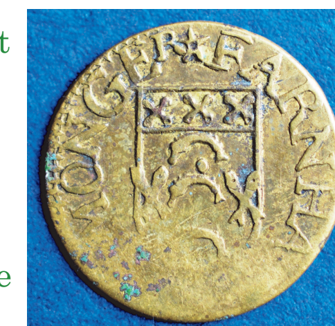
Trader token c.1658 from Farnham Castle

Learn more about the fascinating history of our town and the hidden heritage below our feet by exploring the Museum of Farnham, Farnham Castle and other local sites. Visit www.farnham.gov.uk for more information, including links to the town's informative guides and leaflet series.