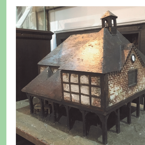
Model of former Market House, later knocked down by the Victorians