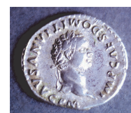
Domitian denarius and Roman well from Neatham