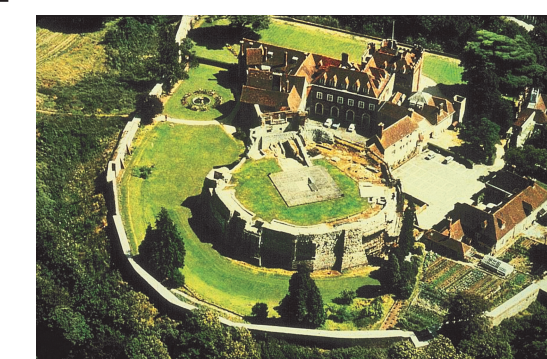
Aerial photo of castle, showing later 12th century shell keep