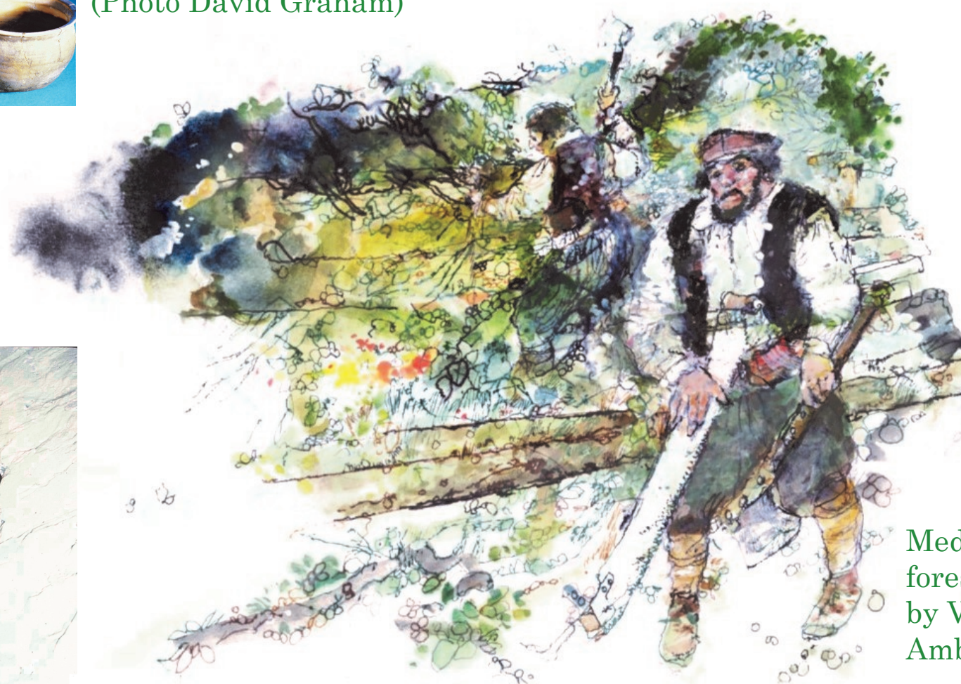
Medieval forester by Victor Ambrus