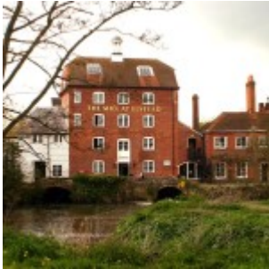
Elstead Mill banner image