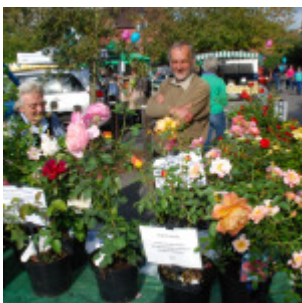
Seale Nurseries at the Farnham Farmers' Market.