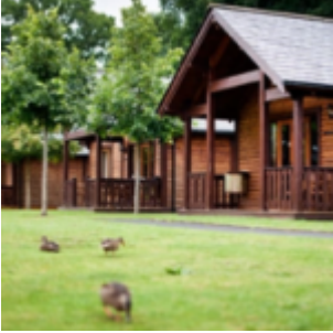
Tilford Woods with ducks