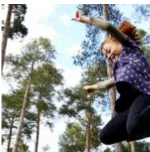
Alice Holt.