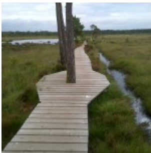
The boardwalk at Elstead Heath