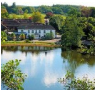
Frensham Pond hotel and grounds