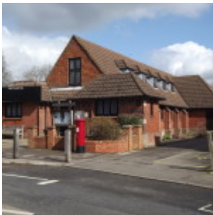
Churt Village Hall

For more information on what to do and see in Surrey see the Visit Surrey website .