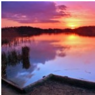
Frensham Pond at sunset