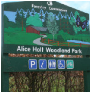
Alice Holt welcome board.