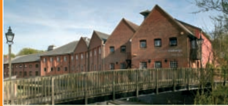
Photography: above Farnham Council All content property of Farnham Town Council and subject to copyright Photography copyright of owner

The map below shows the town centre of Farnham and points out the places of interest such as the Museum, Castle, Parish Church, Farnham Maltings, Art Galleries, areas of open space and will help guide you around the town centre.