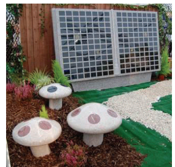
Typical stone book of Remembrance

A footpath, winding its way through newly planted shrubs, will lead to a Stone Book of Remembrance. It is on the brass plaques affixed to this Book that residents of Farnham can be remembered by future generations.