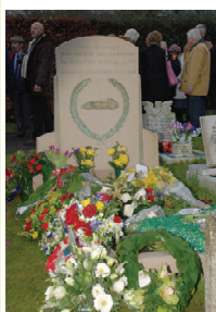
his grave. A & FCC

and breaking up the paths. FTC has now dug up the surface roots and re-laid sections of the footpaths at both Badshot Lea and Hale Cemeteries. If you have been to either of these cemeteries recently, you will see what a huge difference this has made. Further work will be carried out on footpaths in Green Lane Cemetery during the coming year