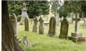
West Street Cemetery

Farnham has 4 cemeteries, all of historical interest. Dating back to the 1860's, Hale, Green Lane, Badshot Lea, and Farnham West Street cemeteries, cover an area of over 100 acres with 25,000 graves and 16,000 memorials!