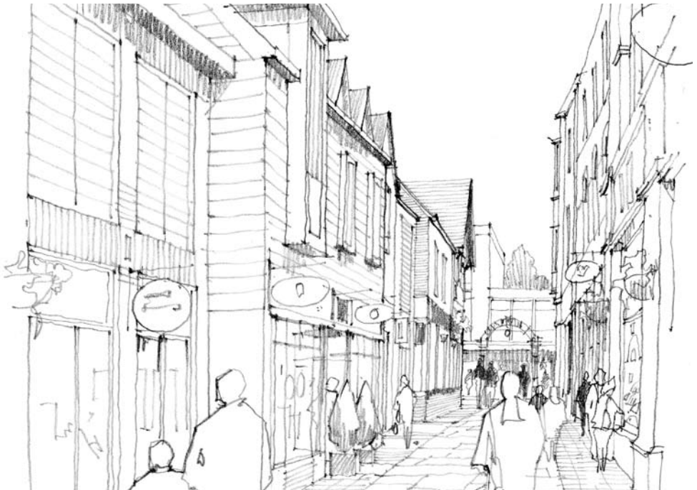
A new approach to street architecture.