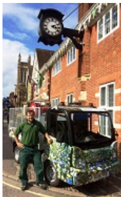
The new hybrid watering vehicle