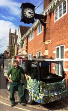
The new hybrid watering vehicle