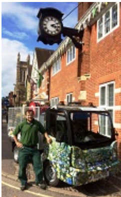
The hybrid watering vehicle